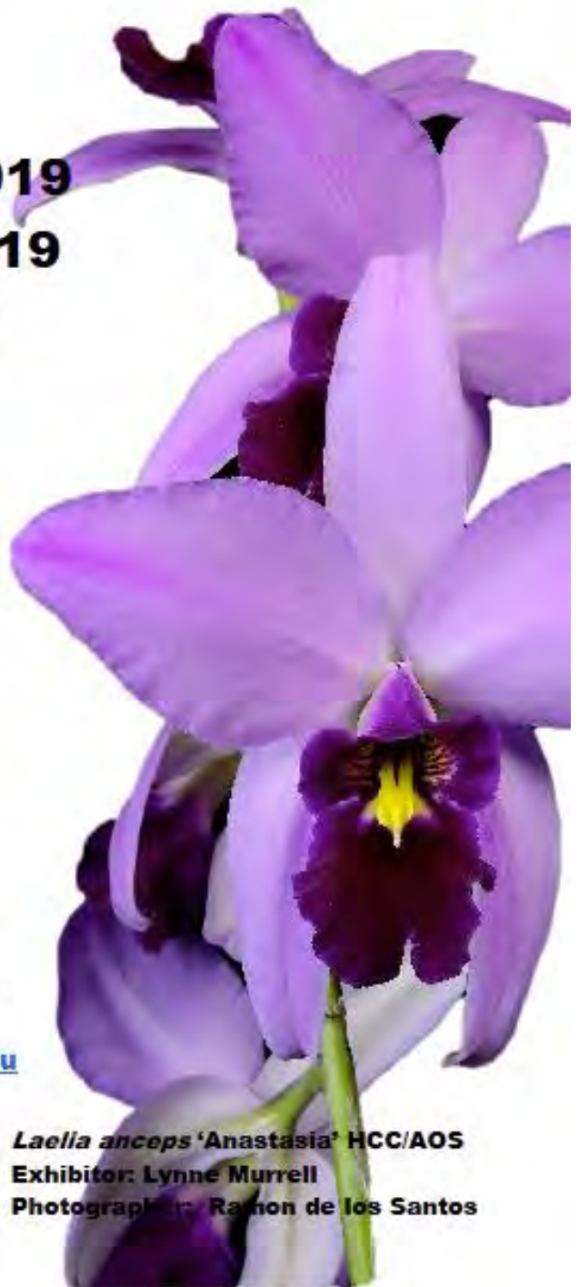
Laelia anceps 'Anastasia' HCC/AOS Exhibitor: Lynne Murrell

There is no cost to attend judging. Standard entrance fees apply to visit Filoli.