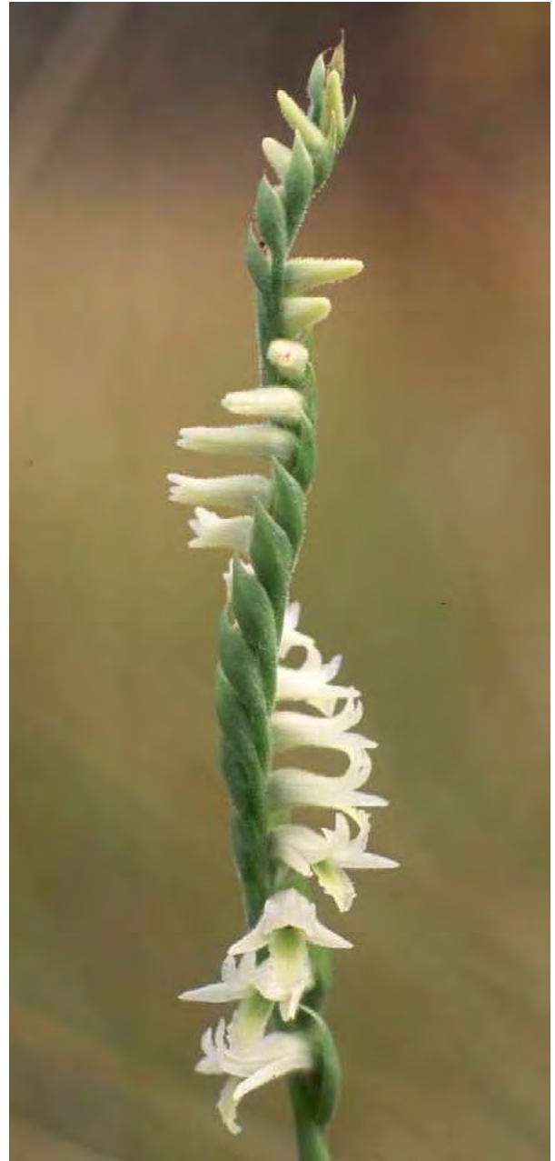
Spiranthes longilabris2 by NC Orchid Spiranthes